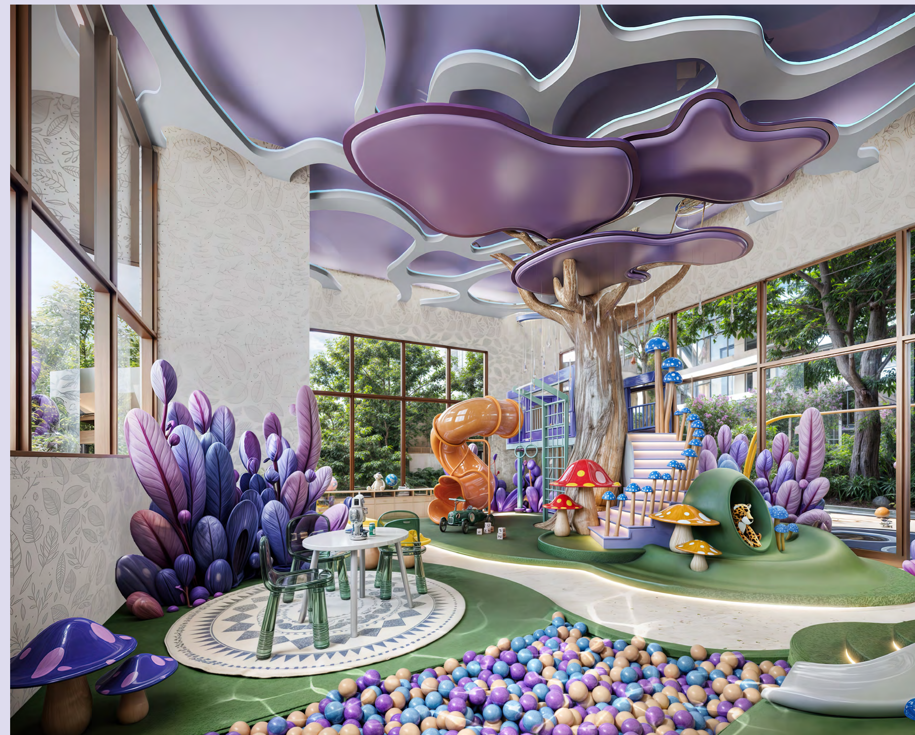
LITTLE EXPLORERS ROOM