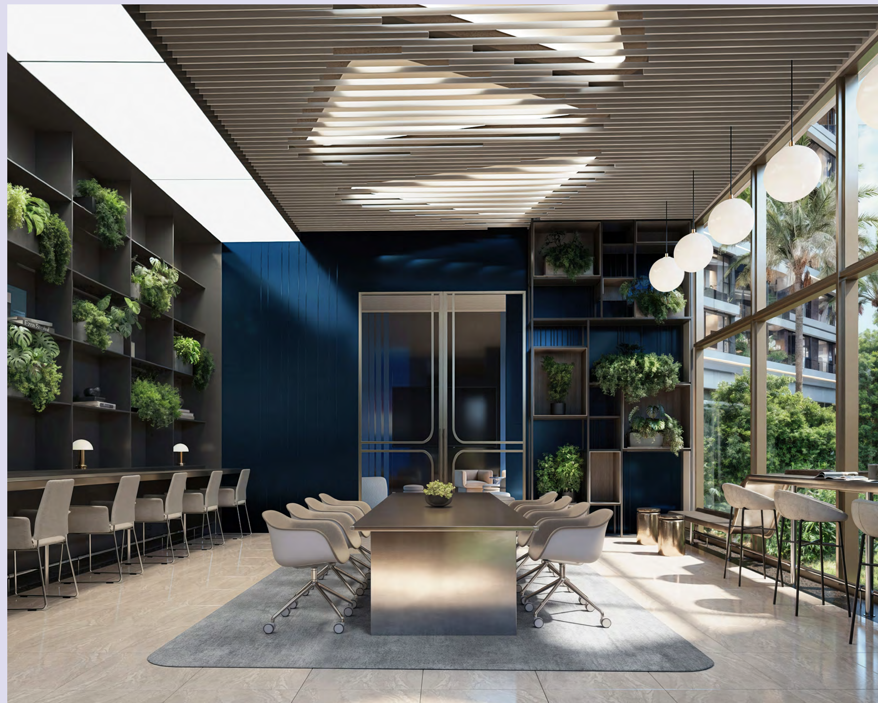
THE BOOK BAR