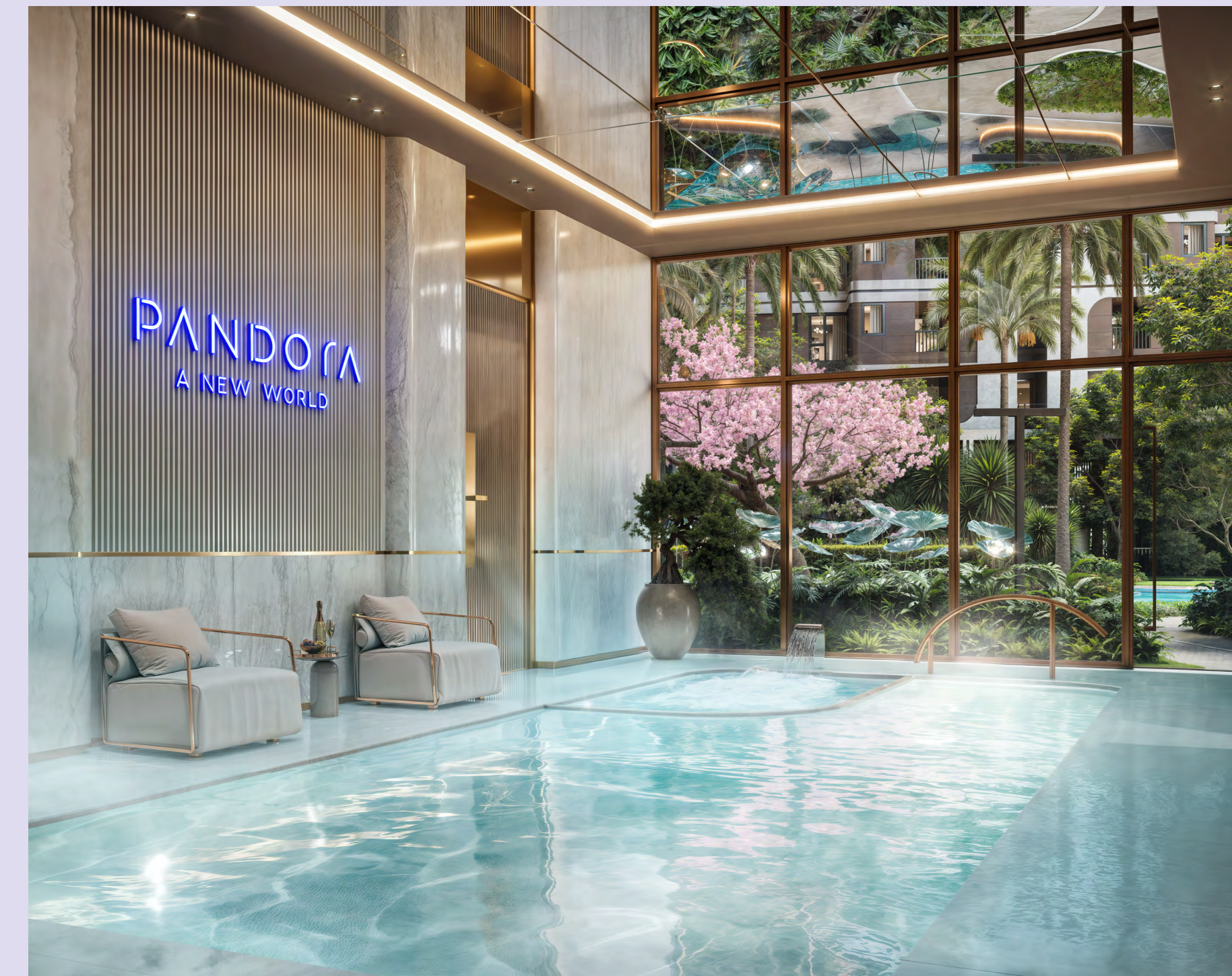
THE TRANQUIL INDOOR POOL