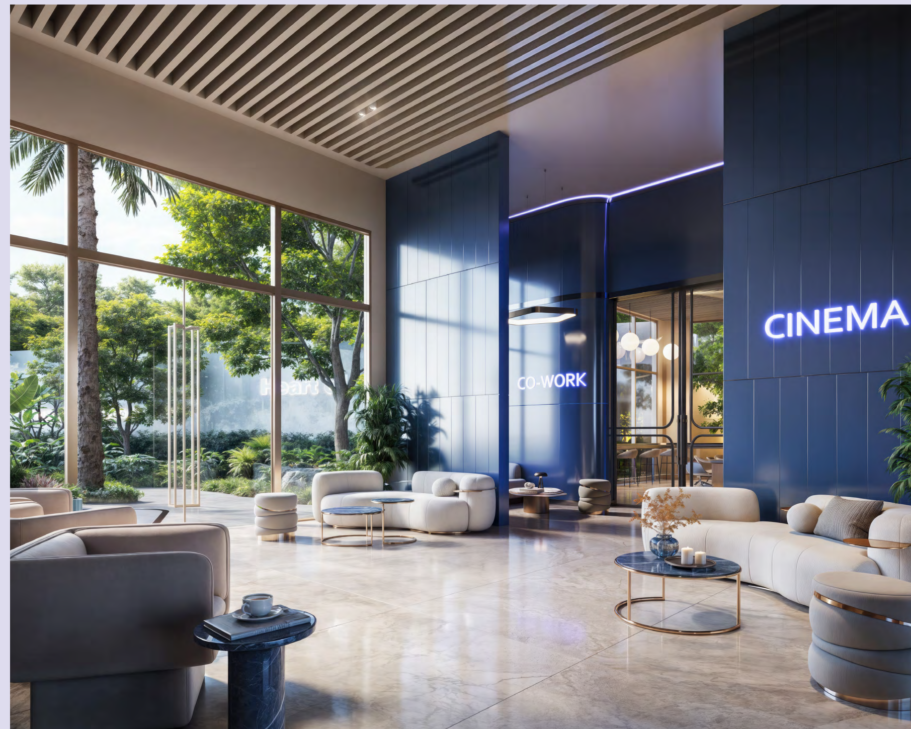
CO-WORK AT PANDORA