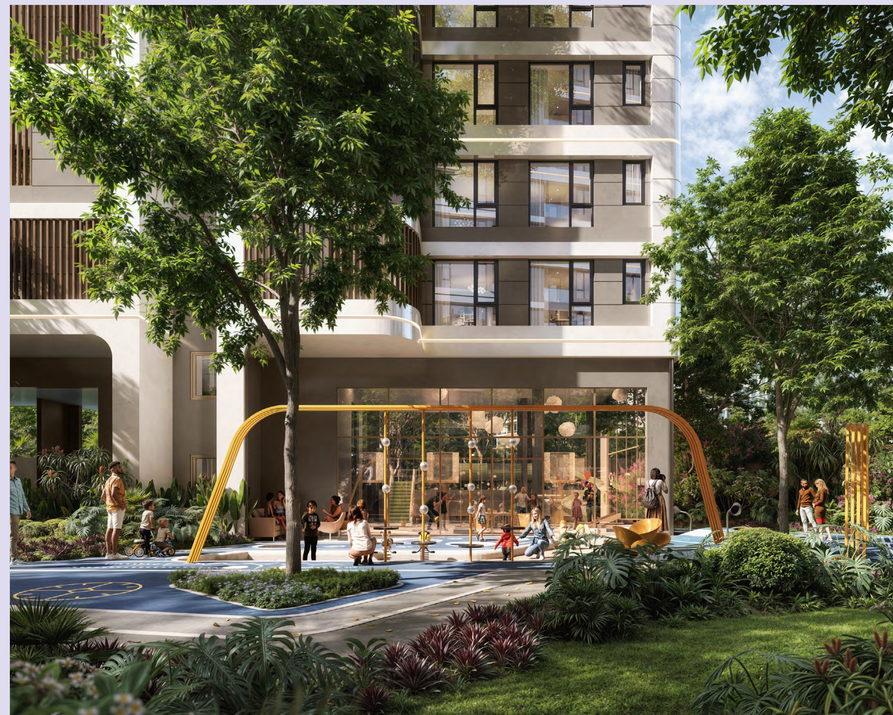
OUTDOOR PLAY AREA